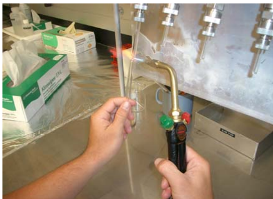
Sealing the combustion tube. Continue twisting the tube until the two halves separate.